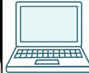
Diagrama com rede 485 via wifi com SW2/ATMC